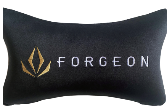
14 Head support