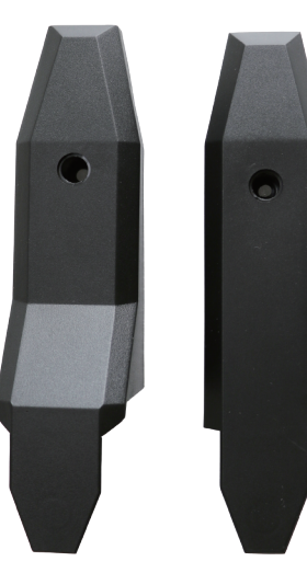
10 Side Covers