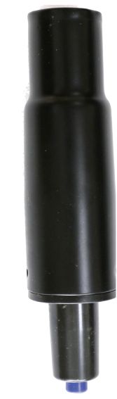
3 Gas Lift