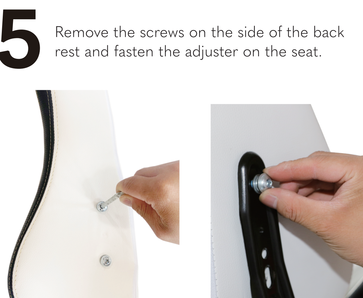
5 Remove the screws on the side of the back rest and fasten the adjuster on the seat.