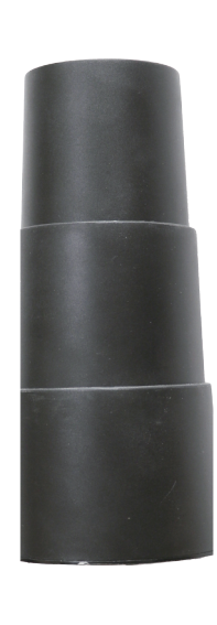
4 Gas Lift Cover