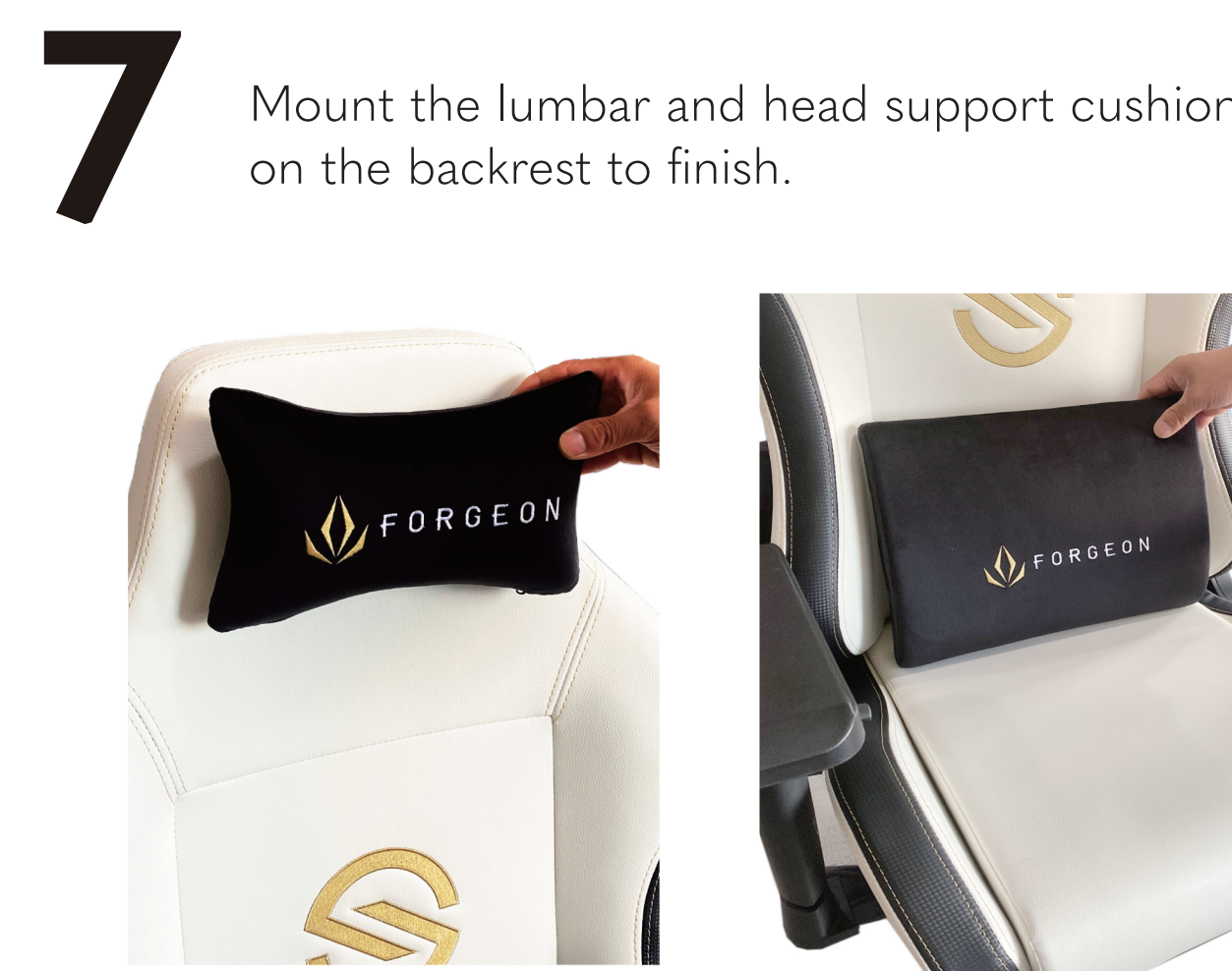
7 Mount the lumbar and head support cushions on the backrest to finish.