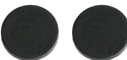
8 Side Covers x2