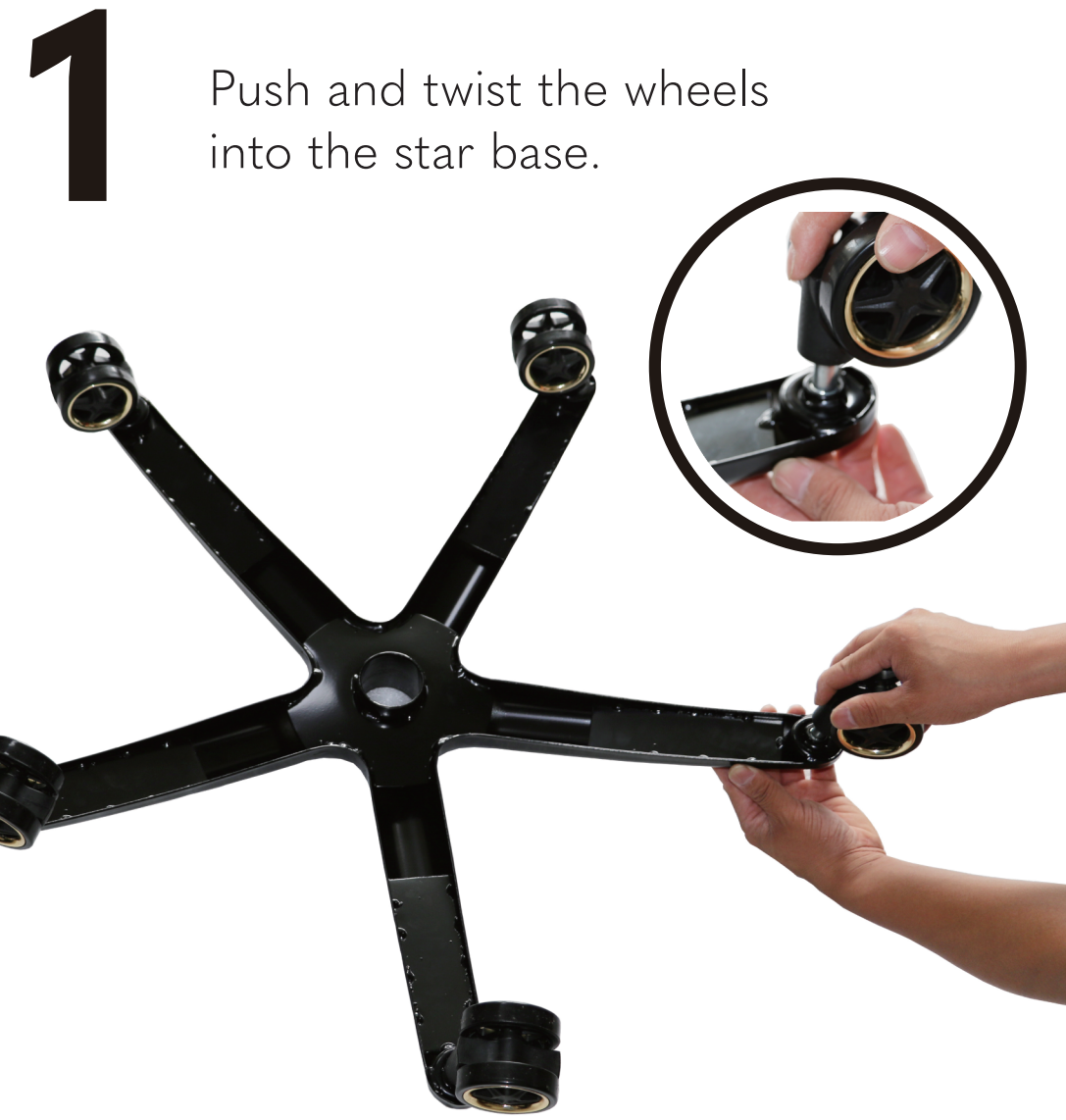
1 Push and twist the wheels into the star base.