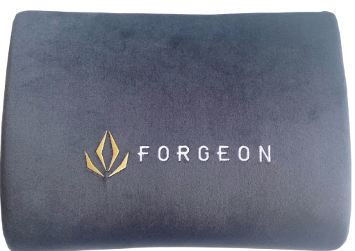
13 Lumbar support