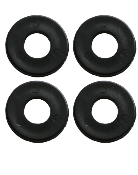
7 Rubber Gasket Q8 x4