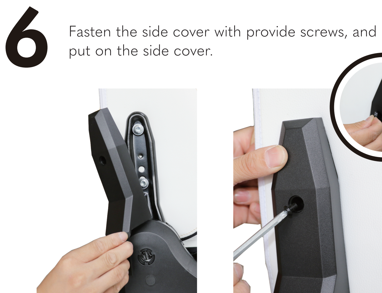
6 Fasten the side cover with provide screws, and put on the side cover.