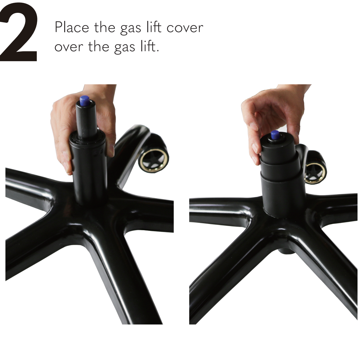
2 Place the gas lift cover over the gas lift.