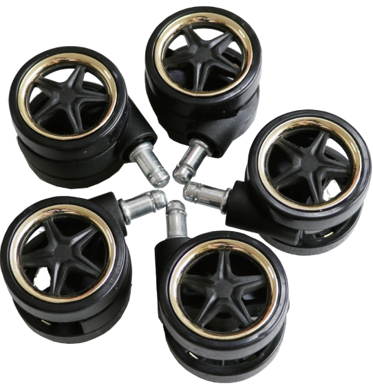
1 Castors x5