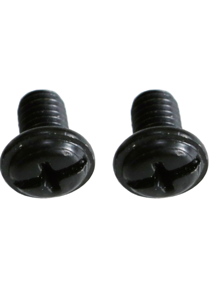
6 M5x10mm Screws x2