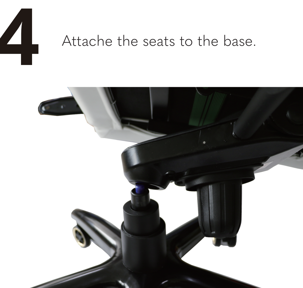
4 Attache the seats to the base.